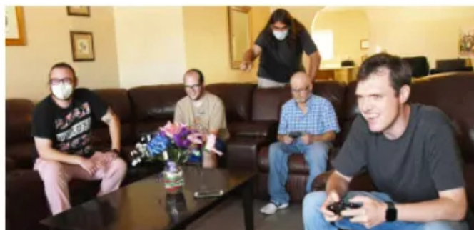
Tenants of a Copa Health Lighthouse Group Home, a form of permanent supportive housing, in Maricopa County.

— The perspective of a homeless services provider interviewed by Morrison Institute for Public Policy